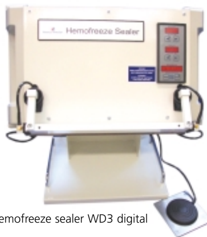
Hemofreeze sealer WD3 digital

A special welding device for easy and durable heat sealing